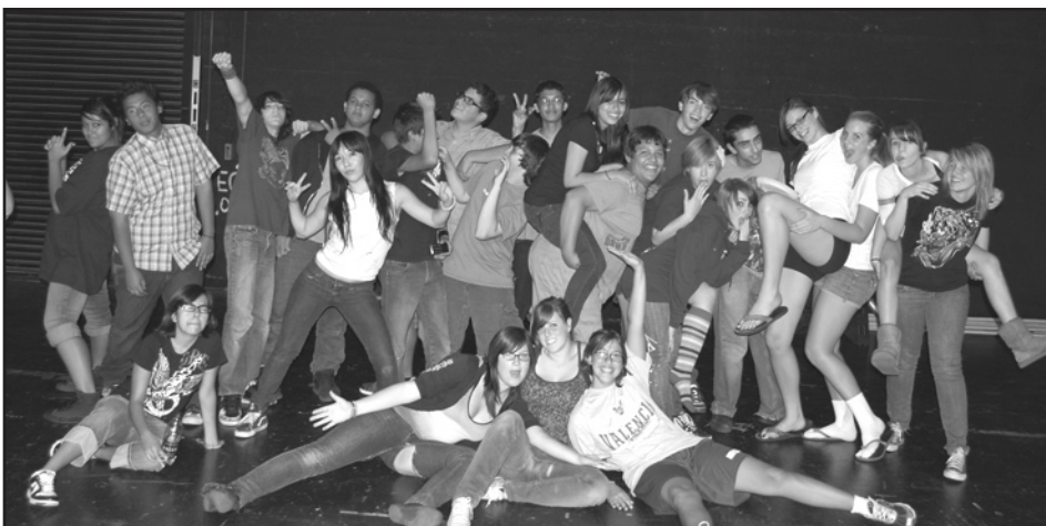
ALL THE STUDENTS WHO ATTENDED LAST FRIDAYS WORKSHOP.

There will be workshops throughout the week of October 5th for those interested in testing their improv skills. Auditions will be held in room 507 before school, break, and after school. The show will be held in the auditorium next Friday October 9th at 7:00 pm. A professional Referee will attend to judge both teams. Comedy Sportz is open to any students.