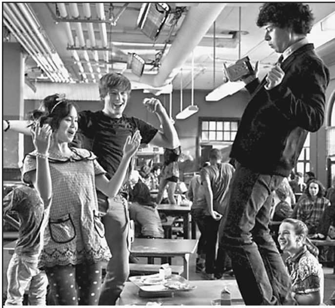
A SNEAK PEAK OF THE NEW MOVIE.