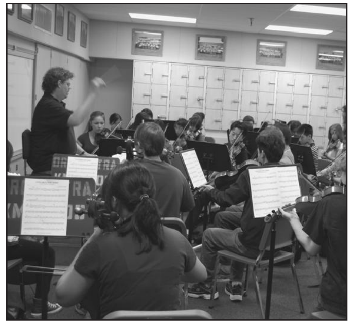
CHAMBER ORCHESTRA MEETS TOGETHER EARLY IN THE MORNING ON TUESDAYS AND THURSDAYS

November 3rd is a District concert, the first concert for our school's Orchestra. Valencia does have one of the best Orchestra groups in the district due to raw talent, long hours of practicing, and well-experienced students and teachers who aid in the