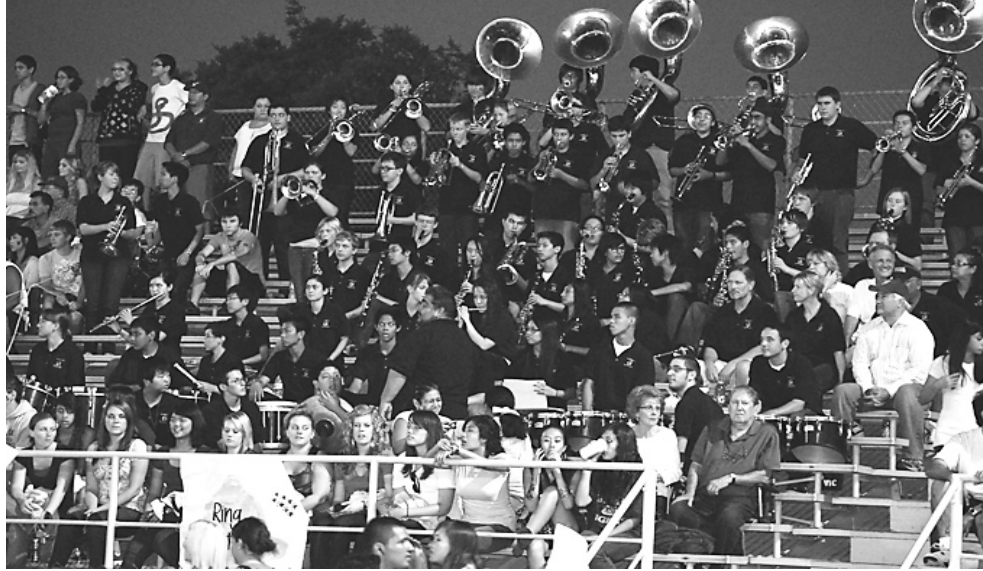
Band Playing at th Bell Game for Support.

and 0 period every morning. They also had the band members attend a 2 week band camp prior to school in order to better prepare the regiment. In these practices the band members take part in various exercises to reach near perfection. They practice marching